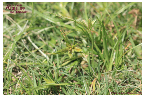
Annual Sedge Sedge

Aggie Turf has an entire website dedicated to identifying turf grass weeds.