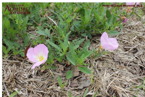
Showy Evening Primrose Broadleaf